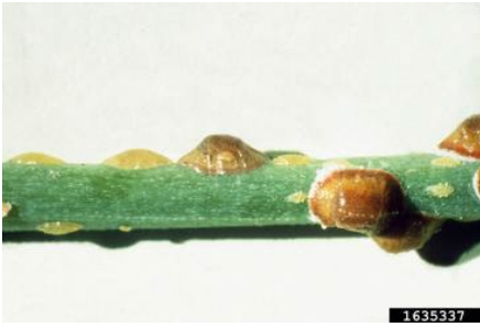
1635337 Infestation with young and mature female hemispherical scale