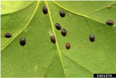
Brown soft scale adults