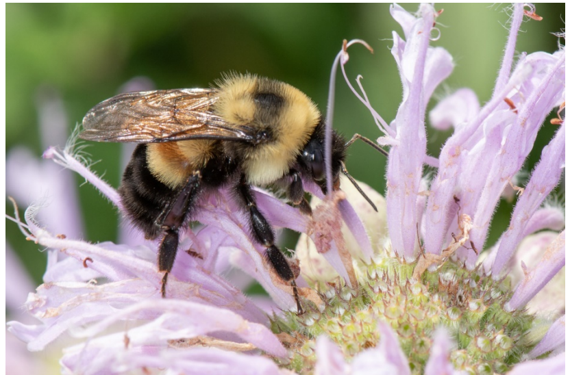
Rusty patched bumble bee ( Bombus affinis ) is an endangered species.

Bumble bees and other pollinators need high quality habitat to survive. For the Rusty patched bumble bee, urban habitats can be just as important as parks or rural landscapes. Keeping areas pesticide free is important for habitat quality and for the recovery of the Rusty patched bumble bee.