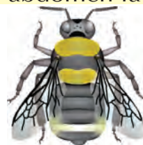
Bombus bohemicus Ashton's bumble bee