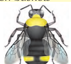
Bombus flavidus Fernalde cuckoo bumble bee