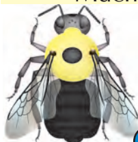
Bombus citrinus lemon cuckoo bumble bee