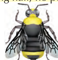
Bombus insularis indiscriminate cuckoo bumble bee