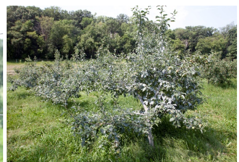
Kaolin clay sprayed on fruit (not blossoms)

Biological controls include insect predators and parasitoids, such as lady beetles and braconid wasps, and are mainly free-living species that kill pest insects. Pathogens are disease-causing organisms including bacteria, fungi, and viruses. They kill or debilitate their host and are relatively specific to certain insect groups. Pest insects and weeds have many natural enemies. Land managers can foster conservation biocontrol by planting biodiverse habitat to support natural enemies. Heirloom and native plants provide pollen and nectar to attract many beneficial natural enemies already at work such as lady beetles and lacewings. Find more information here: ncipmhort.dl.umn.edu/beneficial-insects and here: xcerces.org/sites/default/files/2018-05/16-020_01_XcercesSoc_Habitat-Planning-for-Beneficial-Insects_web.pdf .