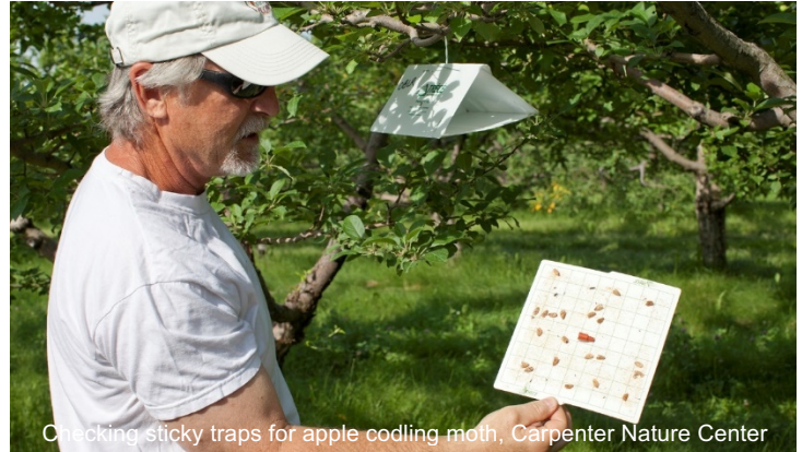
Checking sticky traps for apple codling moth, Carpenter Nature Center

Biorational pesticides are developed to conserve beneficial insects and include horticultural soaps and oils, corn gluten, spinosad, and Bacillus thuringiensis .