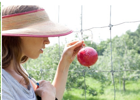
Checking sticky trap for pest insects