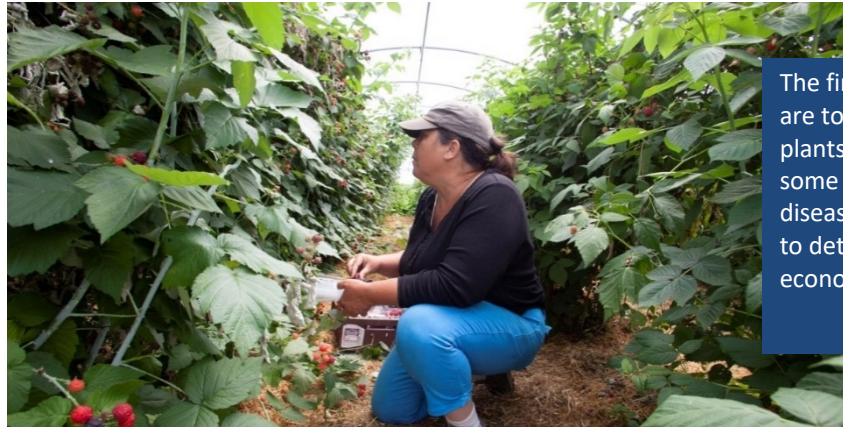
High tunnel, Hoch Organic Farm, Minnesota 2018

Legislative-Citizen Commission on Minnesota Resources (LCCMR) Conservation Biocontrol 2017-2020