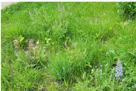
Wait to mow pollinator lawns until 4" or taller

Mechanical and physical controls kill pests directly, block pests out, or make the environment unsuitable for them. Sticky traps are an example of mechanical control. Physical controls include steam sterilization of soil for disease control, or barriers like high tunnels to keep birds and insects out.