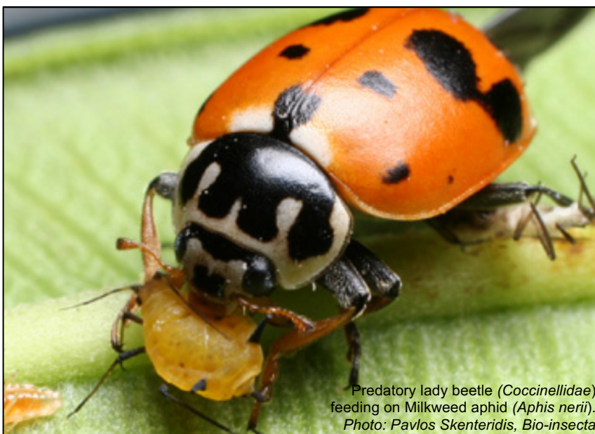
Predatory lady beetle ( Coccinellidae ) feeding on Milkweed aphid ( Aphis nerii ).